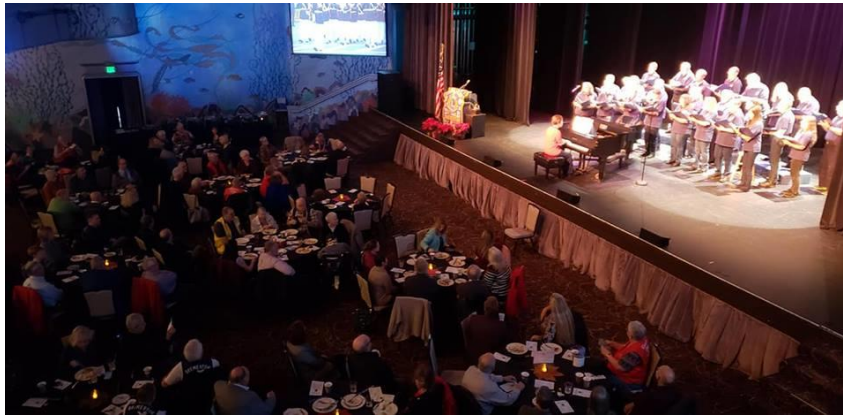
Photo of the crows taken from the Balcony