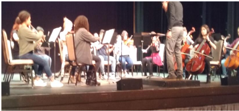
BHS Orchestra students joining us for April 16 club meeting.