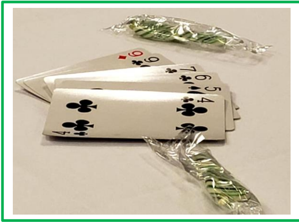
Winning hand in Kiwanis poker game Dec. 19, 2019