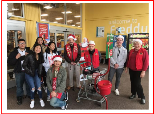
BELLRINGING 2019 – a fun time was had by all and we collected some great donations for Salvation Army! Top – Garden Center door, Top Left- Grocery entrance, Bottom Left – Main Store Entrance