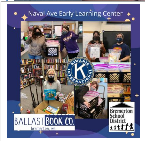
Kiwanis is all about the kids. Just a few shots of the thank you notes received this year for the books, sponsorship of virtual theater, and more. Above are notes from the kids (penciled letter is from a Naval Ave. second grader for his book). Items to the left are from organizations and the staff of the school