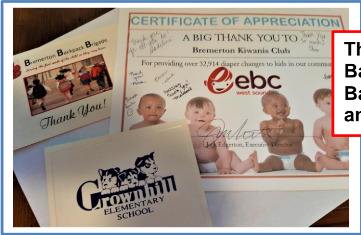
Thank yous from Bremerton Backpack Brigade, Eastside Baby Corner – West Sound, and Crownhill.